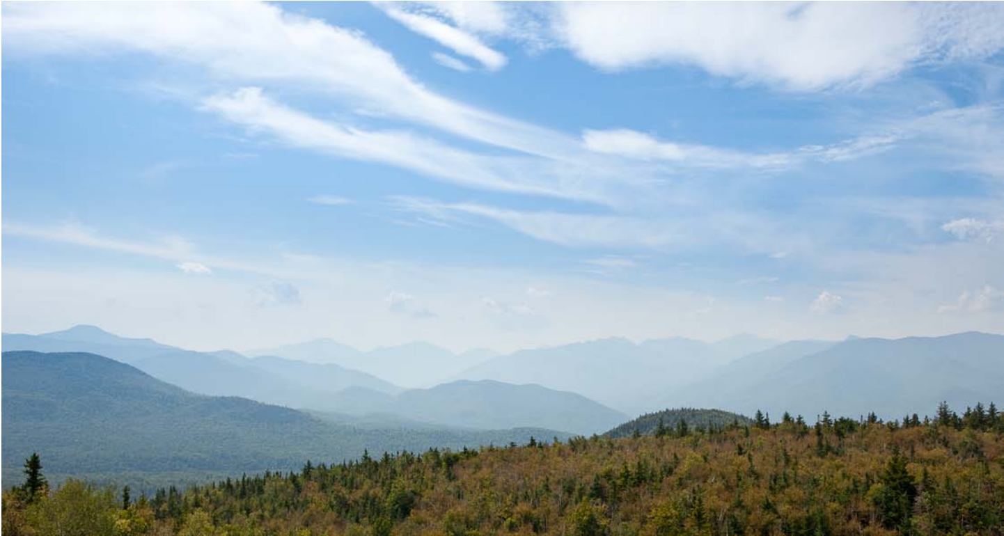
View from Nun-Da-Ga-O

Keene Valley Chapter of ADK P.O. Box 593 Keene Valley, NY 12943