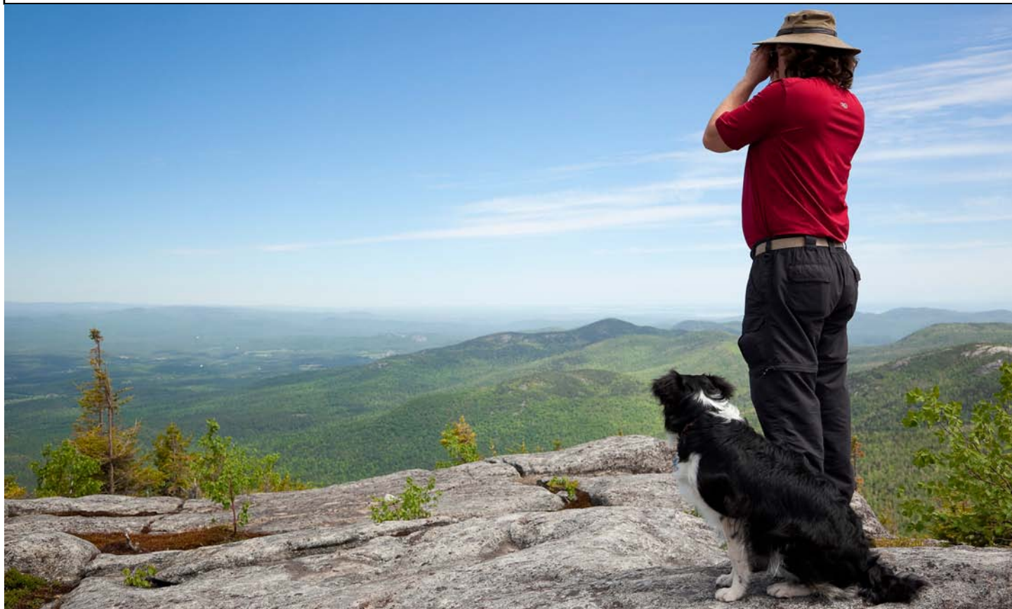
View from the Jay Range