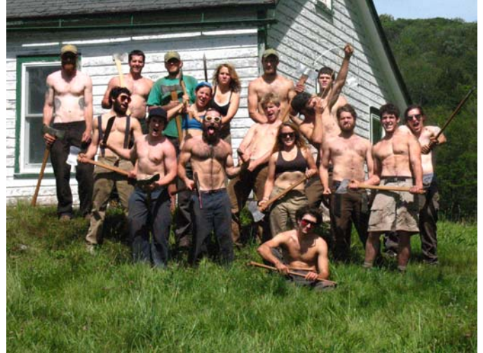
2010 Professional Trail Crew

The trail crew concentrated their efforts in the High Peaks region replacing wooden structures that were failing and also installing erosion control measures on some of the more popular trails. With the generous funding that was once again provided by the 46ers, the trail crew was able to patrol over fifty miles of trail in the High Peaks Region at the end of May.