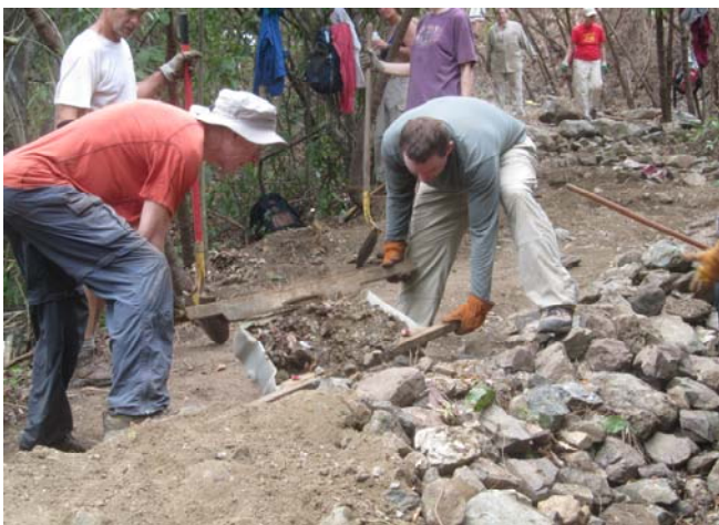
Volunteers add fill to a rock water bar

For the first time ever, the ADK supervised volunteer trails program traveled to the U.S. Virgin Island St. John at the end of February 2011. In collaboration with the Friends of Virgin Islands National Park, ADK volunteers completed trail work on two sections of hiking trail and stayed at a base camp that was located in the Cinnamon Bay campground. Over a five day period, the 20 person volunteer crew completed a tremendous amount of work: 500 feet of new trail was side hilled at an average four foot width, over 400 feet of trail was re-graded at an average width of four feet, seven enormous water bars were constructed, and over 140 feet of new ditches were installed.