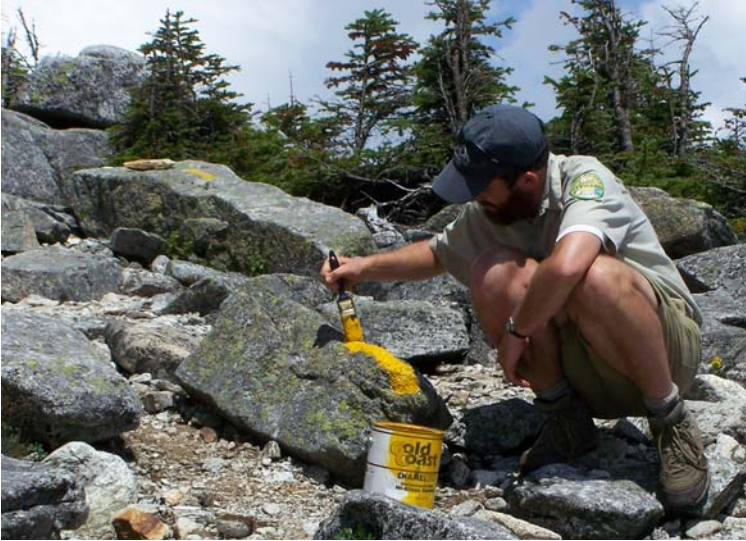
Painting blazes on Whiteface Mountain