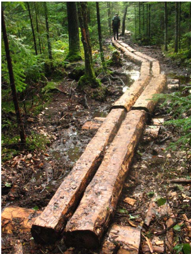
New bog bridges on the Red Horse Trail

The trail crew enjoyed working on the remote Red Horse Trail in the southern part of the Five Ponds Wilderness. Two, large sections of