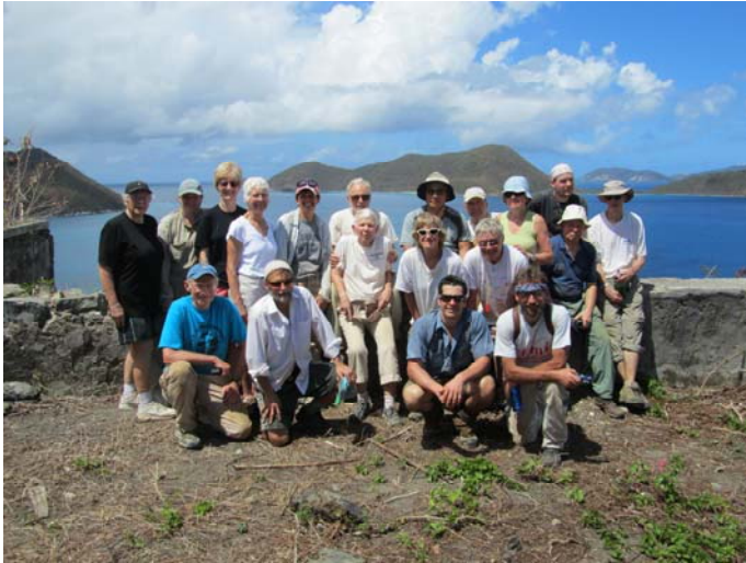
ADK trail volunteers in St. John

For the first time ever, the ADK supervised volunteer trails program traveled to the U.S. Virgin Island St. John at the end of February 2011. In collaboration with the Friends of Virgin Islands National Park, ADK volunteers completed trail work on two sections of hiking trail and stayed at a base camp that was located in the Cinnamon Bay campground. Over a five day period, the 20 person volunteer crew completed a tremendous amount of work: 500 feet of new trail was side hilled at an average four foot width, over 400 feet of trail was re-graded at an average width of four feet, seven enormous water bars were constructed, and over 140 feet of new ditches were installed.