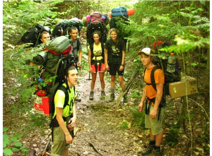
High School trail volunteers packing out on the Deer Pond cross country ski trail.

along with over 200 feet of new drainage ditches. Volunteers returned to Lyon Mountain to make more improvements to the new section of hiking trail that was built in 2008. Eleven rock steps and 88 square feet of scree rock were added to the new trail. Lots of new improvements were made to the cross country ski trail that leads to Deer Pond that is located outside of Tupper Lake on Route 3. Over 60