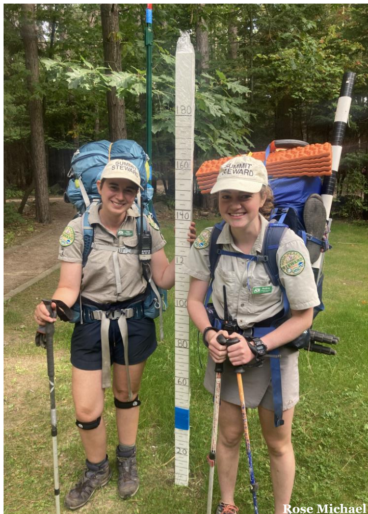
Fall stewards ready to go with AIM & Photopoint Monitoring equipment

could be an indication of the effects of climate change on the alpine ecosystem. AMC has implemented the Northeast Alpine Flower Watch , a citizen science project which asks hikers to use iNaturalist, a phone app, to take pictures of six alpine species in their blooming and fruiting phenophases. Hopefully, this will help create a more robust and complete data set. Feel free to download iNaturalist and participate!