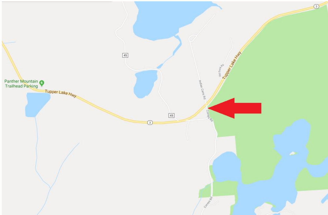
(Zoomed-in map of meeting location)

Notice that Coreys Road splits just before merging with Route 3. ADK hikes meet at the intersection of the eastern branch (the Saranac Lake side) of Coreys Road and Route 3. Please arrive at least a few minutes before the scheduled meet-up time to get your pack ready to go. We have a big day ahead of us.