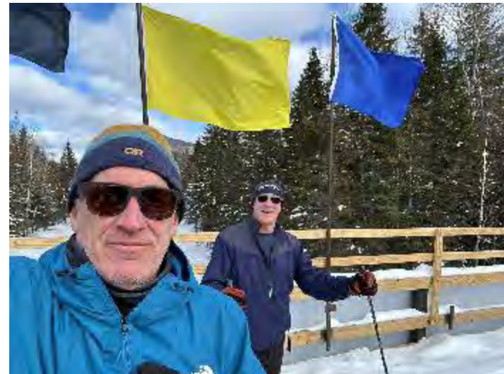
Cross Country Ski at Mt Van Ho

This outing was supposed to be a backcountry ski into Second Pond. During the pre-ski, to check out the trail conditions, it was determined that the conditions were a bit too treacherous. There were multiple falls by almost everyone on the reconnaissance team, and one fall resulted in a broken thumb (only found out to be broken two weeks after the initial whack). So I decided to move the outing to the gentler, beautifully groomed trails of Mt Van Hoevenberg. The snow conditions could not have been nicer; a couple of inches of fresh powder the evening before made even the toughest groomed trails easily ski-able. In addition, the Biathlon World Cup competition was going on, so we had the opportunity to watch athletes from around the world ski and shoot their way around the course located just outside the lodge. Only a couple of people went out after lunch to ski some more mileage. Below is the only photo we have of the outing as we were all having so much fun. ~ Lynn Butterworth