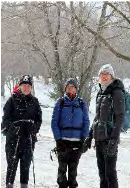
Tupper Lake Golf Course

Four friends set out for the Tupper Lake Golf Course, unsure of what kind of adventure the day would bring. With rain and unseasonably warm weather in the days prior, we didn't know if we'd be cross-country skiing, snowshoeing, or hiking in micro spikes. So we did what any intrepid Adirondacker would do - we brought all of our gear with us. Upon arrival, we found a little bit of everything—patches of snow, ice, and uncovered ground—making for ever-changing conditions. Choosing safety, we opted for microspikes and embraced the outing as a 4-mile scouting mission. The experience left us all eager to return, and it's safe to say this spot is now on our list for another visit next year. ~ Shannon Andersen