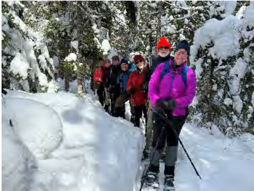
The winter wonderland of Wolf Pond

Enchanting. Magical. Today's snowshoe into Wolf Pond could not have been any better. The temperature was around 20 degrees, with no wind; the skies were azure blue. The snow was fluffy soft on the ground, but had created gorgeous snow sculptures on the rocks and trees all over the forest. Winter beauty was all around. The trail had been broken the first half of the way in, and we took turns breaking trail the rest of the way to the lean-to. Of course, on the way out, we tromped that much faster due to the packed down snow on the trail. Six of us were lucky enough to join Rich and Miok on this walk through an enchanted, snow-covered forest. ~ Lynn Butterworth