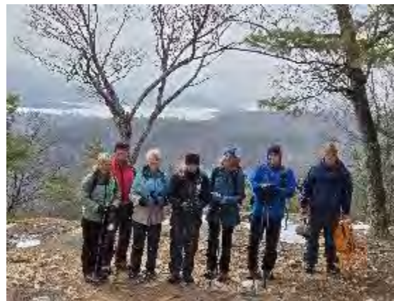
The view from Severance Mtn.

The eight of us started out on a bright but cloudy morning, with temperatures hovering around the 28-30 degree mark. The two tunnels under the Northway were noisy as we crunched our way