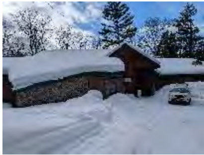
AIC in Newcomb