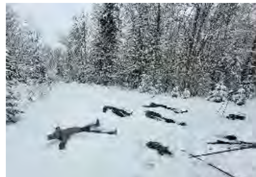
Embracing the snow with snow angels

River. Starting off, we were happy to see that others had preceded us through the soft snow, but they turned right after a mile, and so we broke tracks the remaining two miles down to the bridge. Along the way we had some lovely descents through the beautiful forest. The Hudson River, partially covered in ice, provided a backdrop for our lunch, and then we climbed the hills on the way back. A highlight of our day was the obligatory stop for snow angels in a trailside clearing, led by Gail! All agreed it was a wonderful day's ski. ~ Matt Schwab