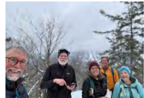
Gore Mtn in distance