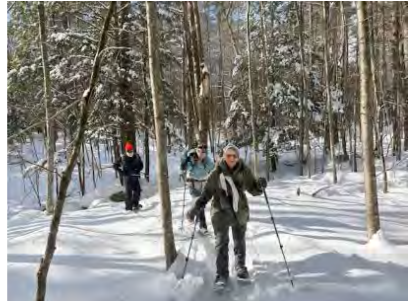
Snowshoeing the Cunningham Trails on a sunny, chilly day

On January 29th, eleven heavily bundled CRC members, including leader Meredith Todd, met near the Town of Chester dog park and enjoyed a couple of hours exploring some of the Cunningham trails. Despite the chilly 10 degree temperature, the sun was shining and the powdery snow made for perfect conditions in the woods. After a brief ascent at the start of the outing, the trails were mostly level, and we tracked along the Cunningham Circle trail, the Middle Trail, the Chester Creek Trail, and the Power Line trail, passing by the site of the tannery that once existed along the Chester Creek. ~ Pam Burns