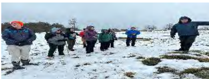
Tom giving a tour of the Crown Point Historic Site