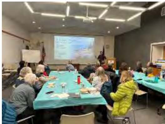
Potluck Speaker at the AIC