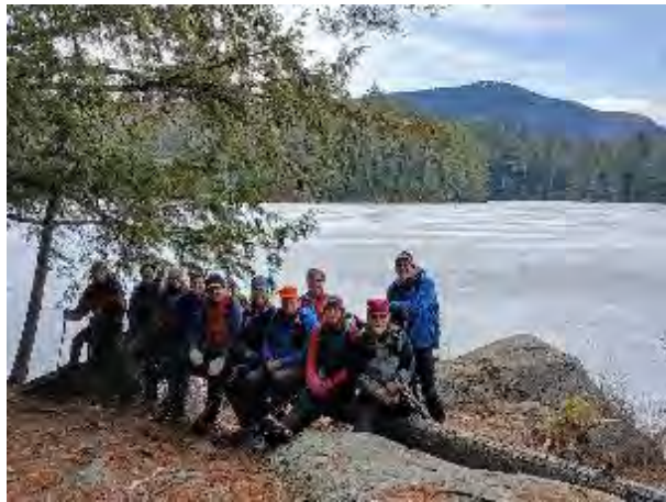
CRC at Goose Pond

March 26: Hike to Goose Pond, Pharaoh Lake Wilderness, Town of Schroon Leader: Meredith Todd