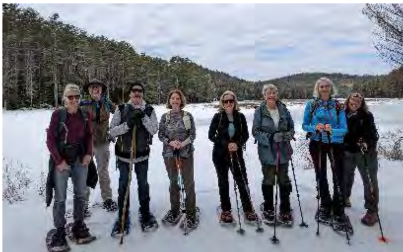
Snowshoe around Pack Forest Lake

Due to the forecasted rain for both Wednesday and Thursday this 4.1 mile loop around Pack Forest Lake was rescheduled for Tuesday. The blue sky and warm temps made the hike nothing short of glorious. Donning snowshoes to tackle the changing conditions in early spring, nine of us handled both the ice and snow while chatting and catching up on winter's events. Meredith pointed out areas to put our boats in, a reminder that it we will be paddling before long. Jim and Anne shared some information about the Pack Forest Camp as we ate lunch at an outdoor picnic area, and Judy shared some delicious cinnamon donut bites from an eatery in Speculator. We headed to the parking lot after an enjoyable hike with CRC friends. ~ Kathy Herold