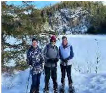
Gull Pond

On this sunny morning, a large and enthusiastic group met to enjoy the first ADK CRC hike of 2026. We settled upon snowshoes, which turned out to be a good choice for this relatively brief but scenic hike to Spectacle Pond, where we enjoyed the views and conversations with fellow hikers. At the hike's conclusion, several people chose to add a brief hike to Gull Pond.