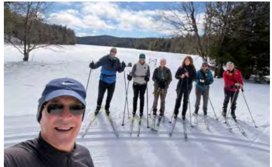
CRC at Lapland Lake Ski Resort