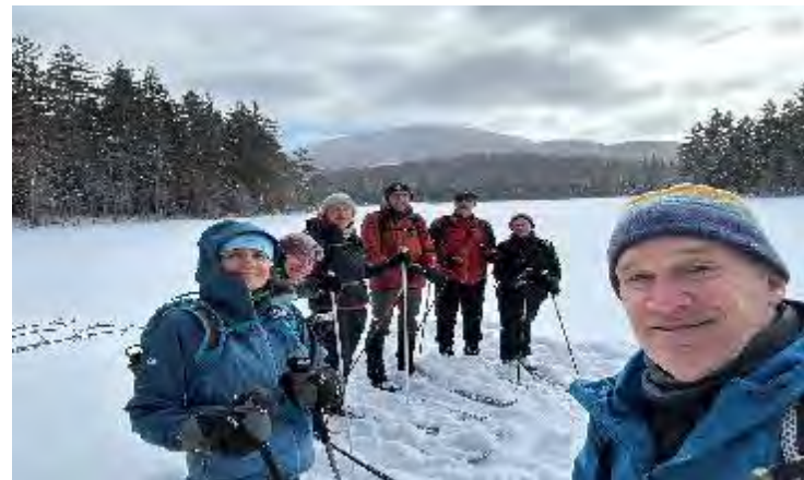
The scenic beauty of the Vly with Gore in the background