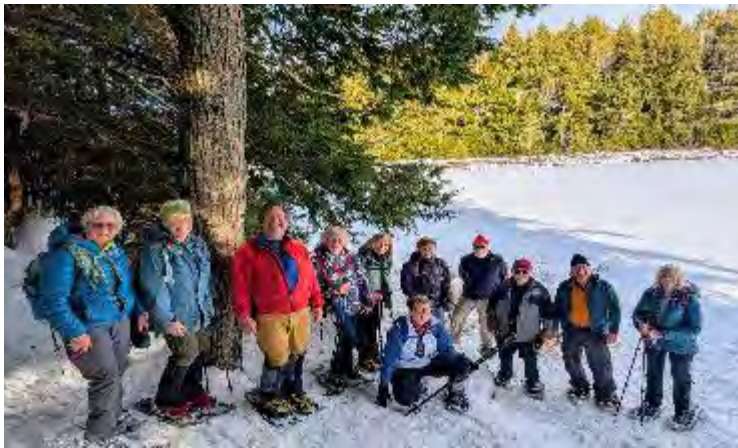
Spectacle Pond

On this sunny morning, a large and enthusiastic group met to enjoy the first ADK CRC hike of 2026. We settled upon snowshoes, which turned out to be a good choice for this relatively brief but scenic hike to Spectacle Pond, where we enjoyed the views and conversations with fellow hikers. At the hike's conclusion, several people chose to add a brief hike to Gull Pond.