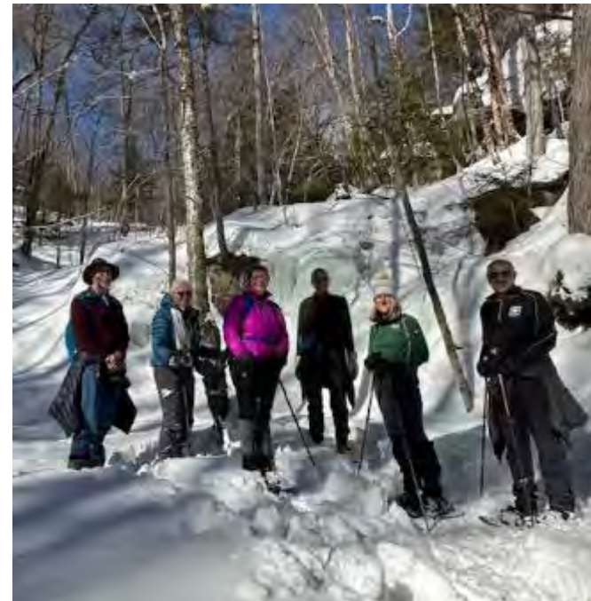
Enjoying the Schaefer Trail in North Creek