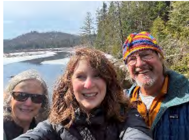
Stewart Creek on the Oregon Trail

On Thursday, we set out to explore the Oregon Trail in Johnsbury, beginning at the familiar trailhead shared with Cod Pond. Instead of turning right, we continued straight ahead, following a quieter and less-traveled path. The highlight of the hike was the steady company of Stewart Creek, which was roaring with the spring snowmelt—its rushing waters were powerful reminder that the seasons are shifting.