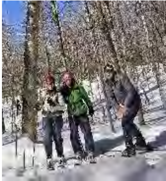
Skiing the Raymond Brook

After consultation with the folks who signed up for the trip, we agreed to go a day earlier to take advantage of the weather. The weather was cold but we had a beautiful blue sky. After a quick check with our outings leader, Rich, to make sure we were prepared, we were on the trail by 10:30, finding some fresh snow on the trail and good powder to the sides. A stop at the historic 1930's ski patrol toboggan sled storage shed was a treat. Being the least experienced of the group, I found the powder very advantageous for keeping the speed down. Rich stopped often to allow us to keep together and get a rest. We made it to the bottom after about three hours, and only had about 30 minutes of skinning total. A wonderful time was had by all.