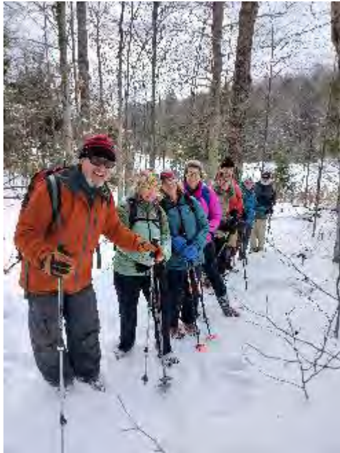
Lost Pond winter wonderland

While the forecast was warning frigid temperatures on the way, we enjoyed 30 degree temperatures and some blue sky with the sun peeking out, doing its magic on the beautiful forest. Tracey led a group of eight into a winter wonderland. Hiking in spikes in a loop around Lost Pond, we enjoyed the company as we chatted, stopping for lunch at one of the campsites as Tracey shared some freshly baked cookies. Another wonderful Thursday afternoon enjoyed by all. ~Kathy Herold