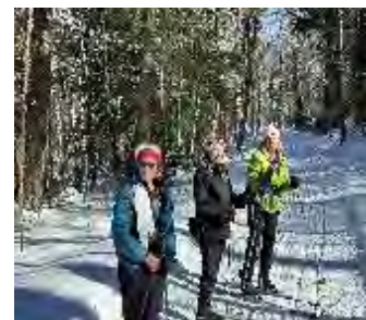
Santanoni Ski