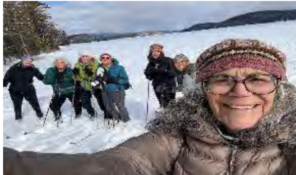
Cross Country Ski at Scaroon Manor