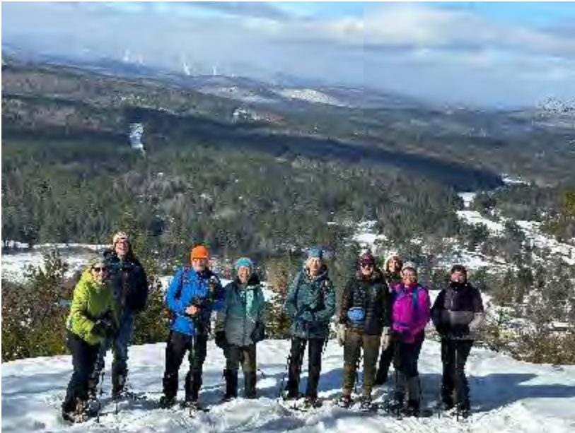
The view from Panther Mountain with Gore in the distance

Ten members snowshoed 1.2 miles up Panther Mountain in Chestertown. The trail had been broken other than a top 2" layer of fresh snow. The 663 feet of elevation gain was gradual. Although a warm temperature of 29 degrees and sunshine were lovely, it was a blustery day. The wind at the viewpoint ledge was almost as impressive as the view westward. ~ Meredith Todd