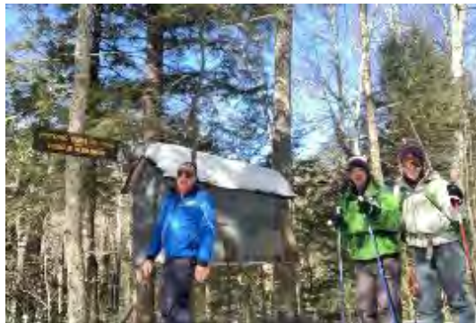
CRC with the Raymond Brook Ski Patrol Shed