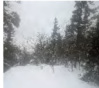
Pine Ridge Snowshoe

The initial portion of the trip was uneventful as the five of us proceeded along the "Big Loop" trail, which had been broken a couple of weeks earlier. But near the midway point of the loop we had to leave that trail, crossing a small stream, and immediately encountered the unbroken, deep snow conditions that would persist for much of the remainder of the trip. From then on we each channeled our own inner