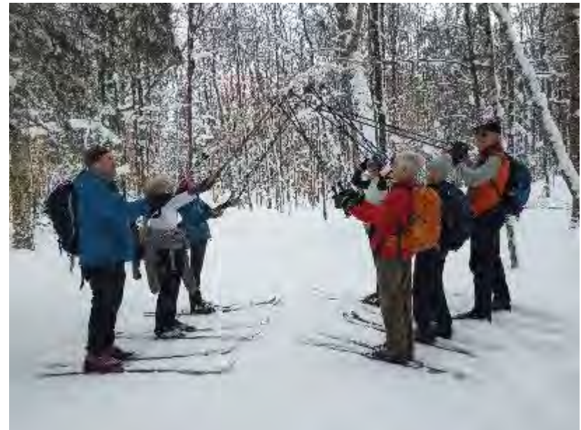
Fern Park cross country ski

Fern Park is a wonderful free area with groomed trails through the woods. We were lucky in many ways. We had Jeanne Tommell to guide us on these wonderful trails with trees laden with snow. Our skis glided well in the comfortable warm temperatures. And we had a warm shelter to enjoy our lunch with chatter and laughs with ski friends. ~ Marti Townley